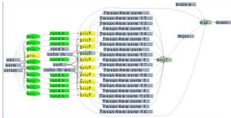
Figure 2. The execution of a small subset of the aphasia study analysis workflow. The colors of the boxes indicate if the task has completed (green) or is executing (yellow). Lines represent data dependencies.

both a local workstation and a distributed Grid environment, and provide initial results in Table 1 below. The performance gains depend primarily on the parallelism that the workflow exhibits (in this case we had two thousand parallel execution threads), on the available number of sites that could execute the applications that made up our workflow (in our case, three sites), and the number of simultaneous jobs executed by those sites (which depends in turn on local cluster sizes, on cluster resource management policies, and on contention on the cluster from the other users that share them).